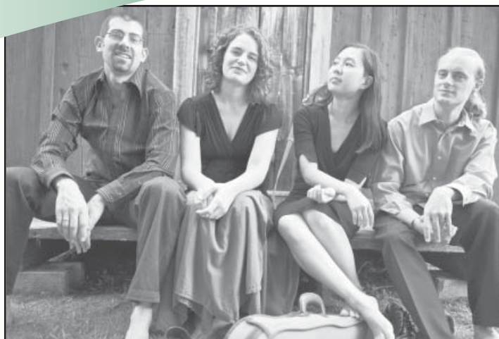
Chiara Quartet in residency 2010